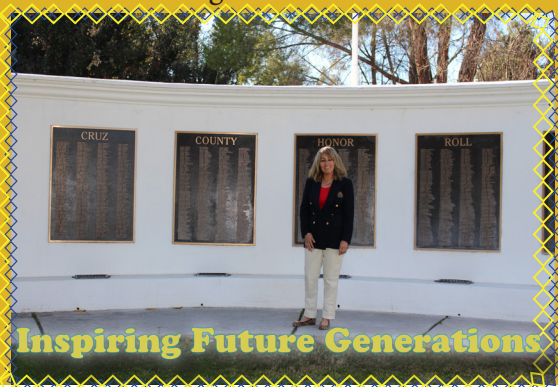
Inspiring Future Generations

I am hopeful the City of Nogales will allow me the humble opportunity to serve them. If interested in being a part of our campaign please contact me directly at 520.371.8159