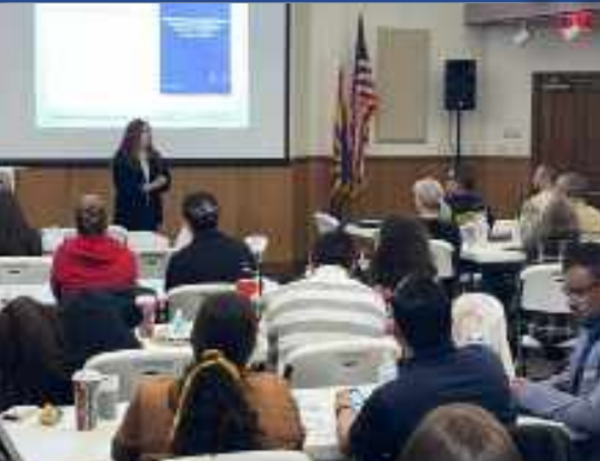
10 Empowering Schools with CSTAG