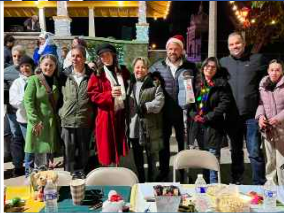
11 Mayor's Corner Holiday Updates