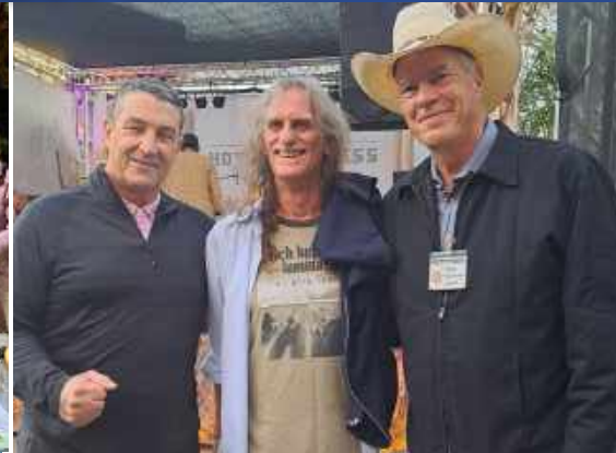
15 Sheriff's Round-Up New Year