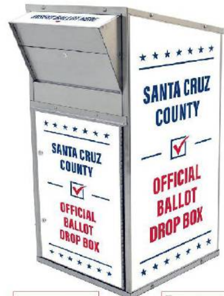
Actual photo of Early Ballot Drop Off Box

Todos los buzones se cerraran a las 7:00 p.m. el Día de la Elección