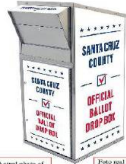
Actual photo of Early Ballot Drop Off Box

TO: POSTAL CUSTOMER ATTENTION POST OFFICE: OFFICIAL TIME SENSITIVE MATERIAL EARLY BALLOT DROP OFF BOX LOCATIONS UBICACIÓN DEL BUZÓN DE ENTREGA DE BOLETAS ANTICIPADAS