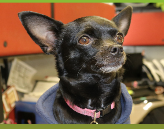
1 7 Smart New ID Tags for Pets