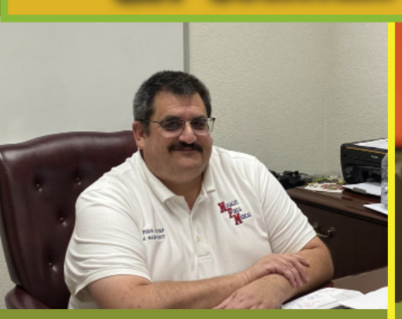
Santa Cruz Center Hosts a Meet & Greet