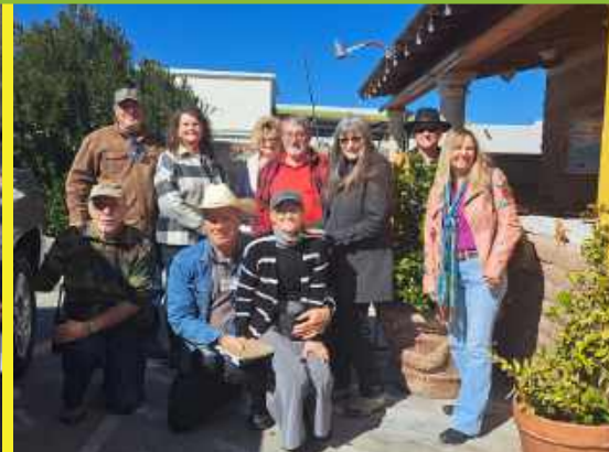
15 Sheriff's Round-Up