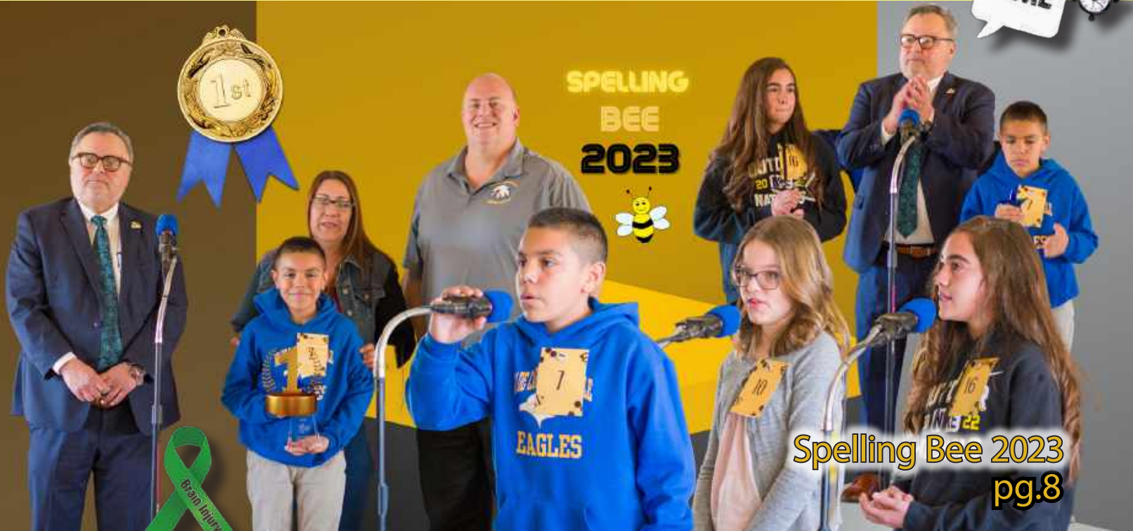
Spelling Bee 2023 pg.8