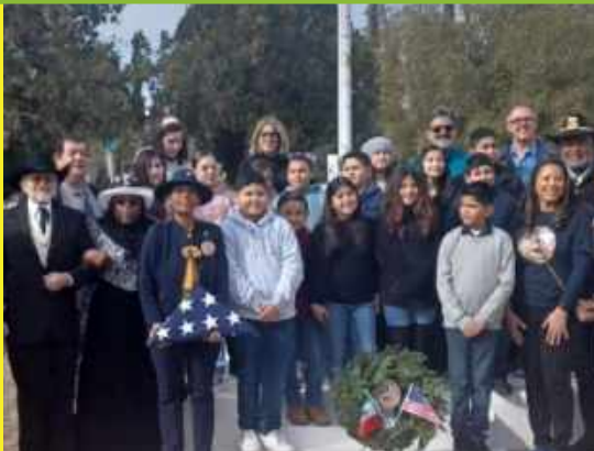
14 Mayor's Corner