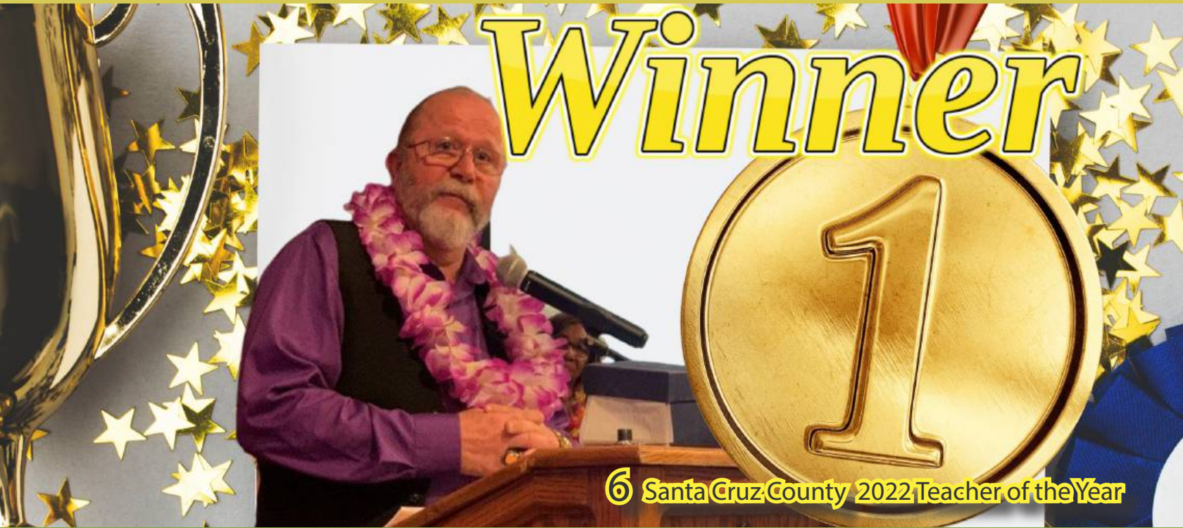
6 Santa Cruz County 2022 Teacher of the Year