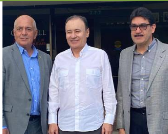
13 Mayor's Corner