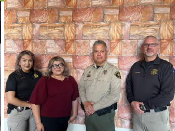
14 Sheriff Hathaway's Monthly Round-Up