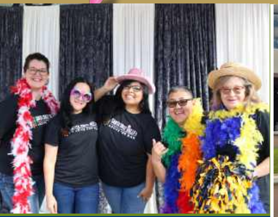
SCV Welcome Back Event 2024