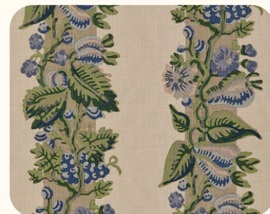
Jongli Cornflower Namay Samay

This fabric has texture and incredible depth of color. It's beautiful and high performance - perfection!