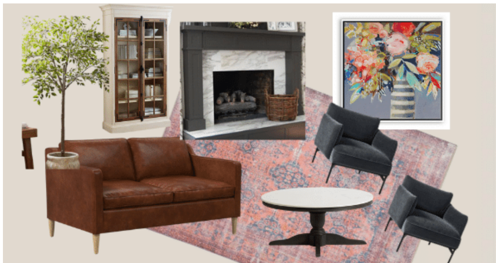
Mood board for another project