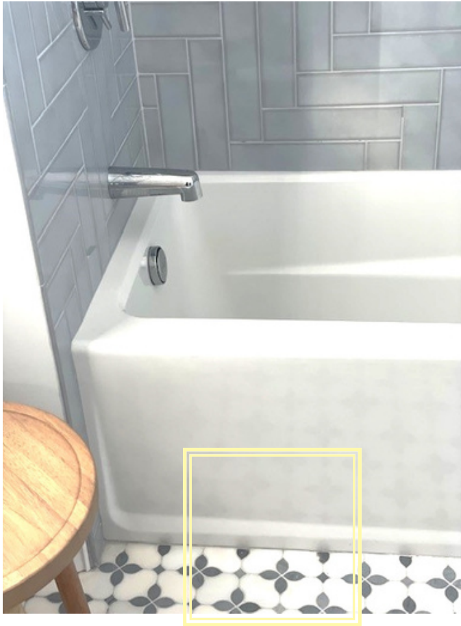
Gorgeous tile install!