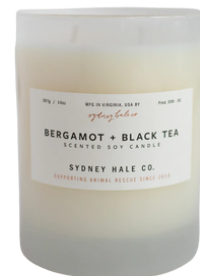
Sydney Hale & Co Candle - Bergamot & Black Tea