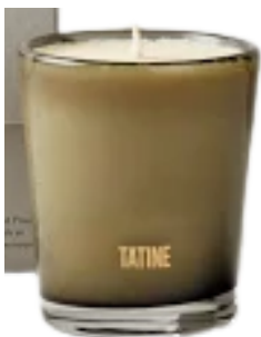
Tatine Candle - Garden Mint

2. Lighten Up the Scents - I have to admit that I only recently stopped burning my fir tree candle leftover from the winter. But candles are not just for the cold weather! Placing some diffusers and light scented candles is always a nice way to lighten up the scents in your home. Some of my favorites: