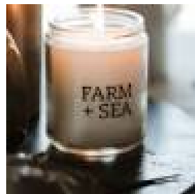
Farm & Sea Candle - Salt Air