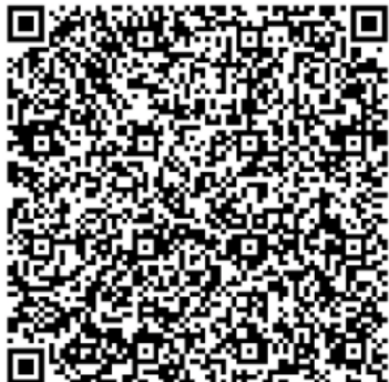
Zelle QR Code

To purchase BBQ Tickets, to use Zelle open your bank app & capture Zelle QR code