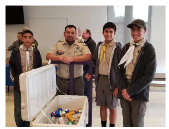
Boy Scout Troop # 87 helped with beverages & greeted Vets

Join us Thursday, April 6th 11 am—1:30 pm for the next Mini Stand Down & Appreciation BBQ at the Santa Maria Elks