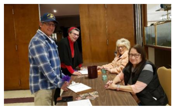
Those who registered had a chance to win a $25 Walmart Gift Card