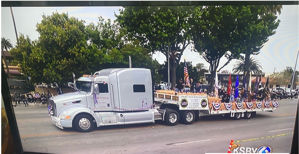
1st Place Ribbon for "Civic & Service" Float.