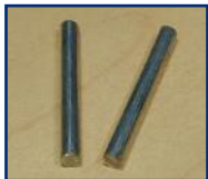
Die Pins are 3/16" dia. x 1-5/8" L for 1" T Section and Bobst 4" & 5.5" Sections. Available in bags of 100 each.