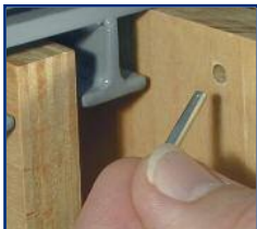
The "T" rack slides used on Platen storage systems. Dies slide in the channels supported by 2 pins.

Platen die storage racks store up to 237 dies, and the Bobst racks up to 90 dies. Standard units are 12' high (different frame heights are available), 10' long and 48" or 60" deep. 5,000 lbs. can be carried on the lower (5") channel beams, 6' from the floor. The 2 upper (4") channel beams can each hold up to 2,500 lbs.