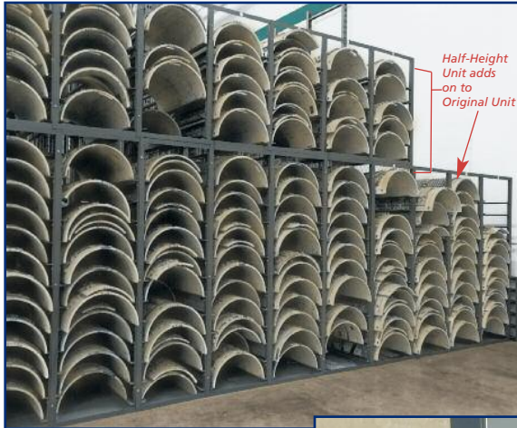
Half-Height Unit adds on to Original Unit

Rotary cutting dies are stored easily and efficiently in a Henderson storage rack. Dies are nested for maximum die storage in a minimum of space, and are safely kept and securely centered with our exclusive "lip" slide design. Plus our die location system, using Henderson labels, makes retrieval fast and easy.