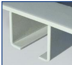
The twin "L" configuration of the Bobst rack, dies slide on the twin "L"s supported by 2 pins.

Each storage system is designed for maximum support, constructed of heavy gauge steel, triple-welded for strength and durability, and come in a powder-coated grey finish. Easy to assemble using the hardware included.