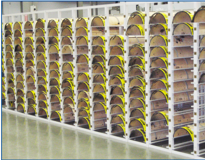
Henderson Rotary Die Storage Systems are available for a wide variety of dies, presses and inside diameter die boards. EVOL Storage Racks shown above.

Safely store your dies and save money at the same time!