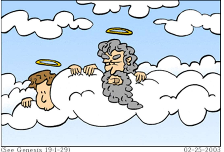
SOMETIMES I MISS THE OLD TESTAMENT DAYS WHEN WE COULD SMITE THEM FOR THAT KIND OF BEHAVIOR