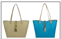
Beige/ Sky Blue