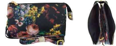
Front with crossbody strap and inside view