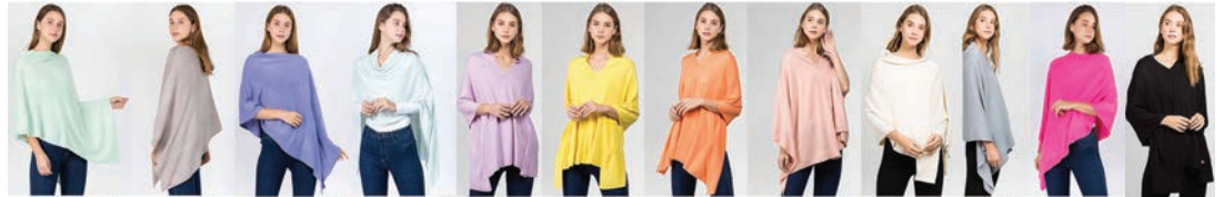
PGN LTAN PEK BBL LA YE LOR LPK IV LGR NPK BK