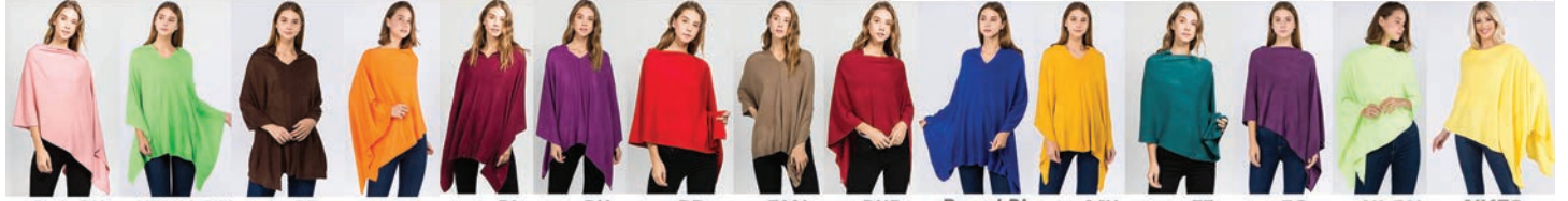
PalePK KELLY GN BR NOR PL PU RD TAN BUR Royal BL MU TE EG NLGN NYE2