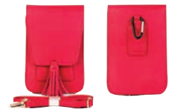
Red (7075) with adjustable crossbody strap and back view

FEATURES: Vegan leather with magnetic closure and fringe trim. 2 inner pockets. Comes with a metal clip, fanny pack, buckle loop and adjustable cross body strap. Also has a credit card holder with 4 slots. Holds all regular size iPhones. Exterior measures: 4.5"W x 7"H x 1"D.