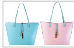
BB Blue/BB Pink