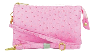
Color BB Pink shown with detachable wrist & crossbody strap

FEATURES: Comes with wristlet strap and adjustable cross body strap. Exterior measures: 8.25" H x 5" W x 1"D and is depth expandable.