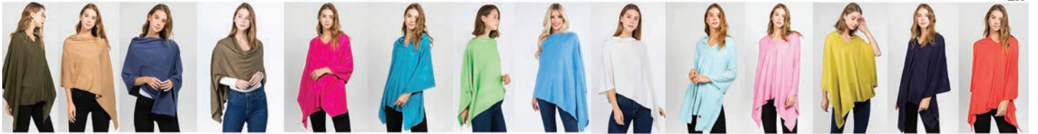
OL CA BL SGY FS TQ NGN NBL WT LBL PK LGN NV CO