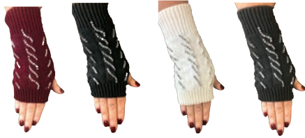
Burgundy Black Ivory Grey

FEATURES: One size fits all, acrylic knit glove with bling accent. Fingerless for texting.