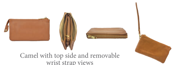
Camel with top side and removable wrist strap views

FEATURES: Zip top closure with multiple compartments and credit card slots. Simple design with great storage. Made with vegan leather, gold-tone hardware, solid-colored cotton lining. Includes 8.5" detachable wrist strap. Exterior measures: 4"H x 7"W x 1"D