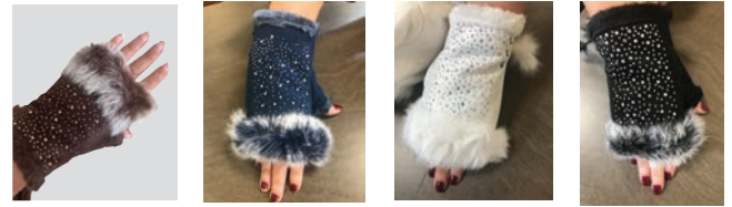
Dark Brown Navy White Black

FEATURES: One size fits all, faux-suede glove with fur trim and bling accent. Adjustable toggle to tighten around wrist. Fingerless for texting.