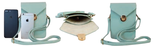
Mint front view with phone comparison, inside view and with crossbody strap

FEATURES: High quality faux leather, solid-colored fabric lining, gold-tone hardware and removable, adjustable crossbody strap. Holds all regular and plus size iPhones. Exterior measures: 8"H x 5.45" W x 1"D