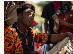
Maroon Law Hold Oh!