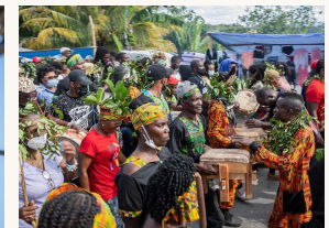
285 Years of Paying Homage