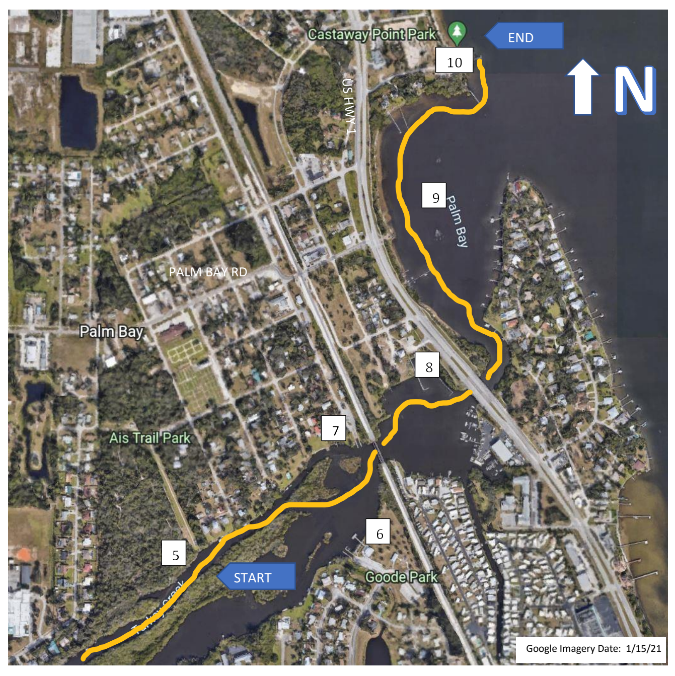
Detailed Map of Route 2: Kayak Launch to Indian River (Stops 6 - 10)