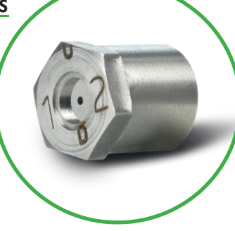
Round Jet Nozzle Inserts

Designed for a flat spray and round spray makeitpossible to achieve an optimum result for different paints.