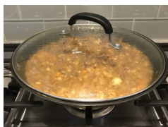
Meat Pie Preparation