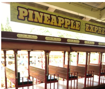
Pineapple Express photo was taken at the Dole Plantation in Hawaii.

*Should you chose to freeze and serve again at a future date (freezer mason jars are amazing for this), allow the dole whip to soften a little (10 minutes or so) and re-blend in your blender.