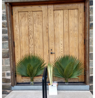
The Way of the Cross

Resources for Holy Week. Palm Sunday, the begin-