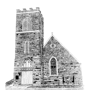
Season of Pentecost July, 2020