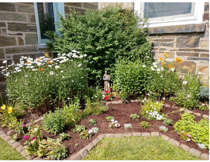
Memorial Garden, June 2020

If you have questions, please call or email the church office, 570.888.5715 or information@trinityathens.org.