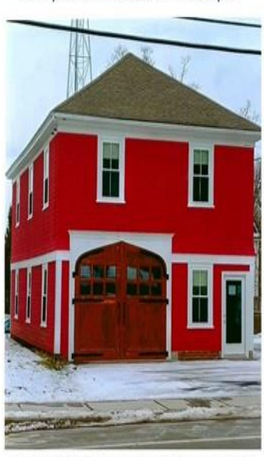
January 2024 photo of exterior renovation