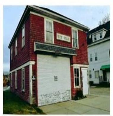
2011 photo of the station in disrepair