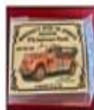
2024 Dash Plaque $5