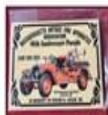
2023 Dash Plaque $3