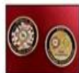
2022 Convention Challenge Coin $5

Items can be ordered by emailing: mafaatreasurer@gmail.com