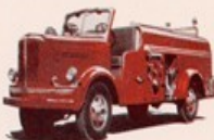
FWD model KHS, 500 gallon pumper recently purchased by the City of Anchorage, Alaska.

tors that count in fire-fighting—speed-power-traction-safety. Cities from coast to coast value the plus performance available in FWD apparatus. FWD builds a complete line of fire-trucks—all types, all sizes—with rotary or centrifugal pumps in triple or quadruple combinations, aeri-als, etc. Write for literature.