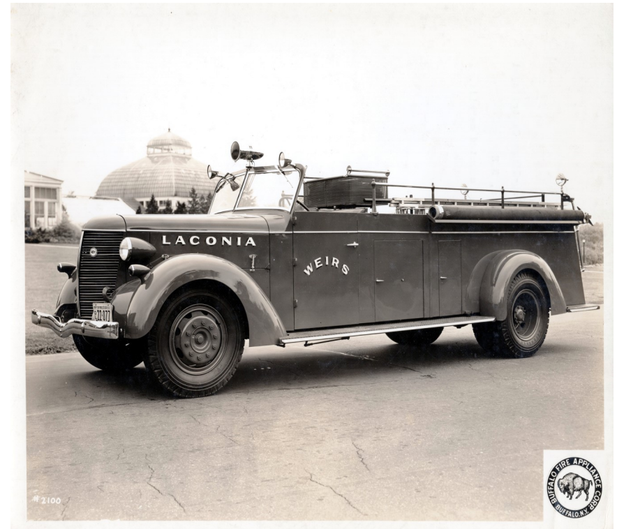
1: Laconia, NH 1939 model w/ 500 gpm pump

Buffalo Fire Appliance Corporation built several trucks for New England. Here's a sampling. . . .