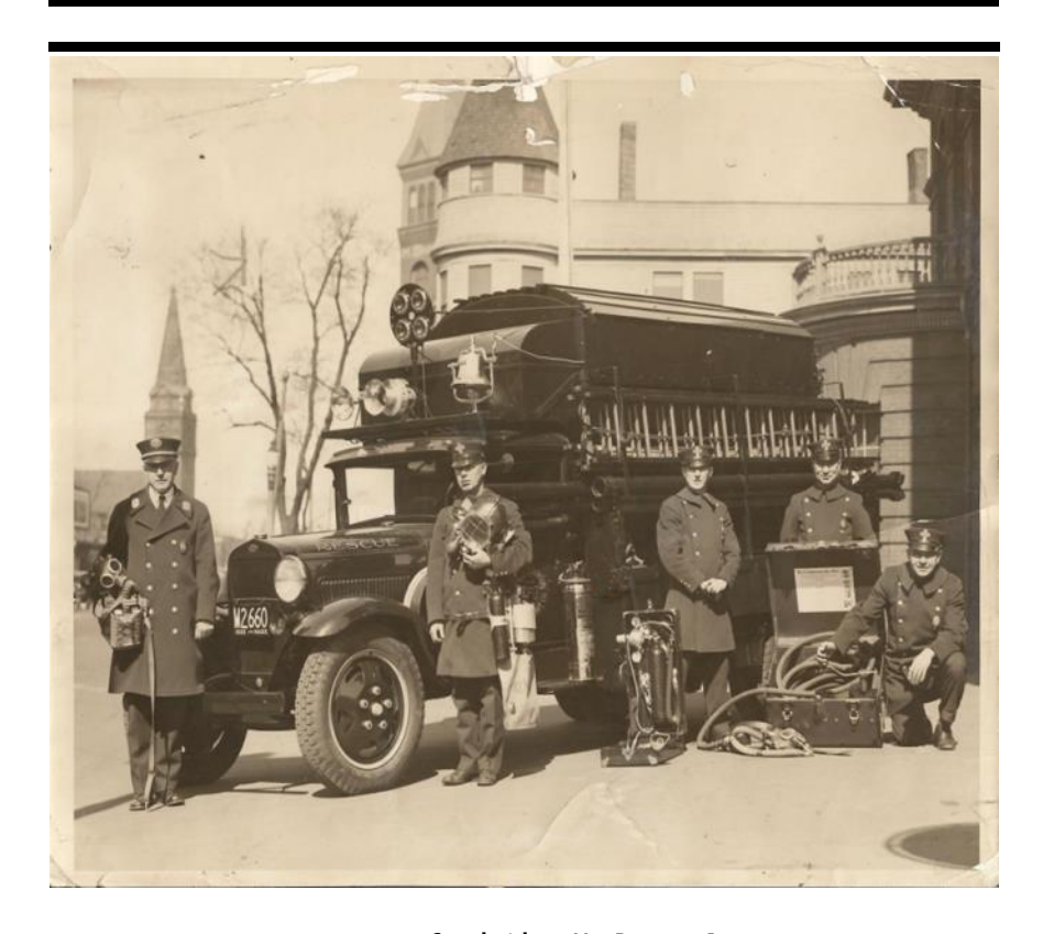
Cambridge, Ma Rescue 1

The first rescue, a 1932 Model AA rescue truck was first housed at the current Station 4 at 2024 Mass. Ave.