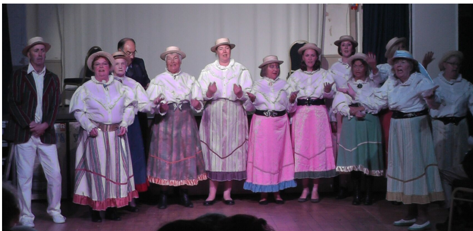
The Tourism Group relive the Pierrot Shows of the 1900s over a weekend in Port Erin and Port St Mary. What fantastic evenings were had by all! See