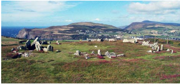
Bronze age burials