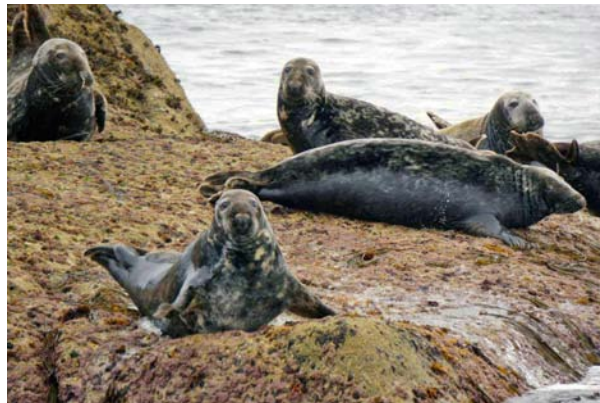
Seals playing on the rocks

Rushen Heritage Trust is led by volunteers keen to preserve and celebrate our history and heritage, YOUR SUPPORT WITH A SMALL ANNUAL SUBSCRIPTION will enable volunteers to pursue the preservation of our history.