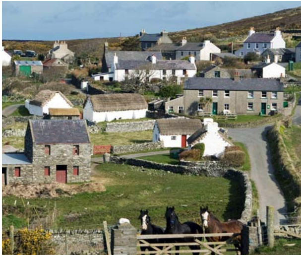
the Heritage village of Cregneash