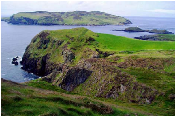
the Calf of Man