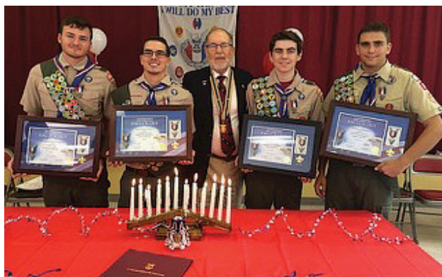
Clearwater Chapter, FL