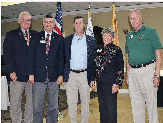
Sun City Center Chapter, FL