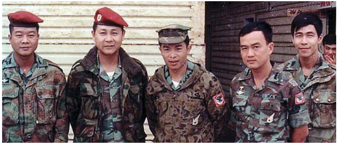
Special Forces: Vietnamese Airborne Division

My introduction to Vietnam was a bloody experience. We deployed by American Navy assault boats and Army helicopters into the swampy river delta south of Saigon. This was combat without glory, fighting and drowning in the saltwater muck. There was none of the adventure that we felt in Ranger school. My captain, an incredibly professional and competent senior adviser, was killed. Back at base, I helped carry his body off the helicopter. It was only the beginning.