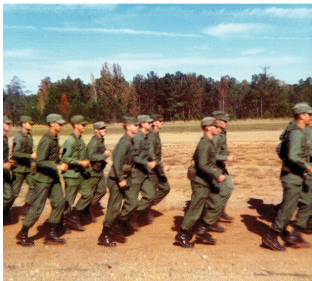
Ranger Class 2-73 passes in view at its graduation ceremony on 9 Nov 72. 3rd Ranger Company (Harmony Church), Fort Benning, GA. This was a fine occasion considering the "bowl of cherries" day had occurred only a few days earlier.

In the darkness, the ship pitched and yawed as the sea became angry. The wind and rain increased its intensity, adding to the misery of seasickness. No one dared stand. Just when it couldn't get any worse, I heard someone yelling my name. To my great disappointment, I learned that I would plan the