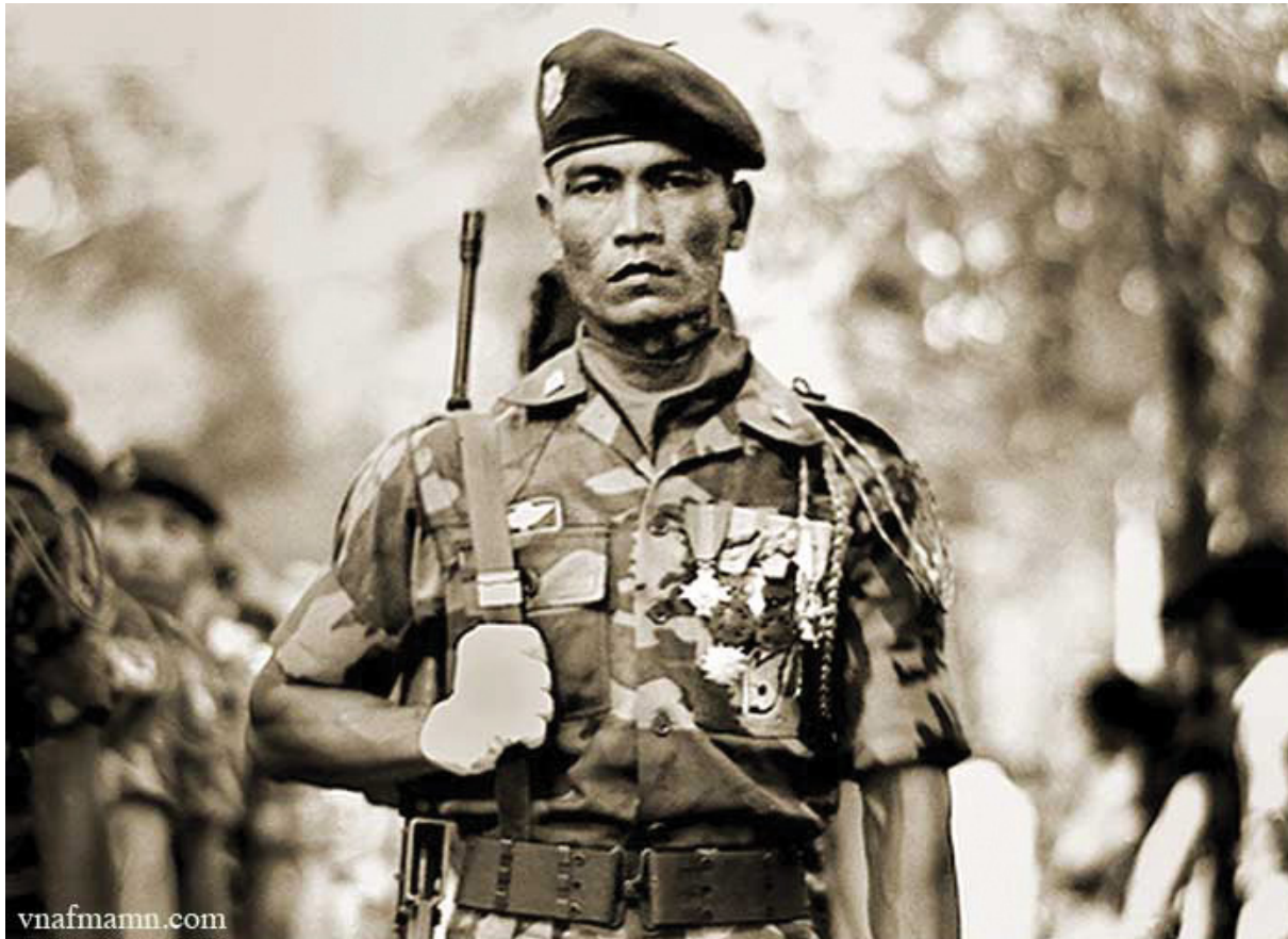
ARVN Airborne Soldiers

GEN BARRY R. MCCAFFREY, USA (RET) MOWW' 2018 DISTINGUISHED SERVICE AWARD RECIPIENT