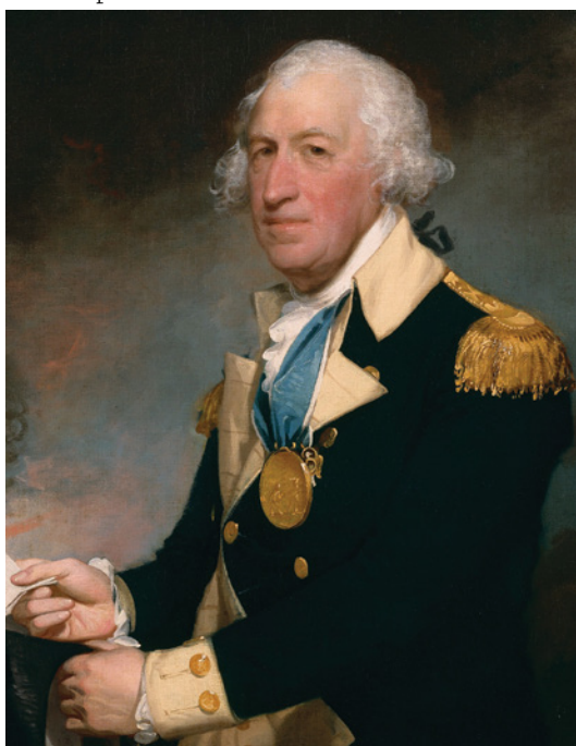
American Army GENERAL HORATIO GATES 26 July 1727–10 April 1806 (aged 79) Buried: Trinity Church, New York City, NY Portrait by Gilbert Stuart, 1793, Metropolitan Museum of Art, New York

allowed the Americans to successfully withdraw southward. This slow advance through the woods depleted Burgoyne's supplies and exhausted his soldiers. It also disheartened his Indian allies who began to desert in large numbers. Burgoyne divided his force and sent a portion to pursue the American rear guard as it retreated into Vermont. The British engaged it in an inconclusive battle at Hubbardton, Vermont, which resulted in heavy casualties on both sides.