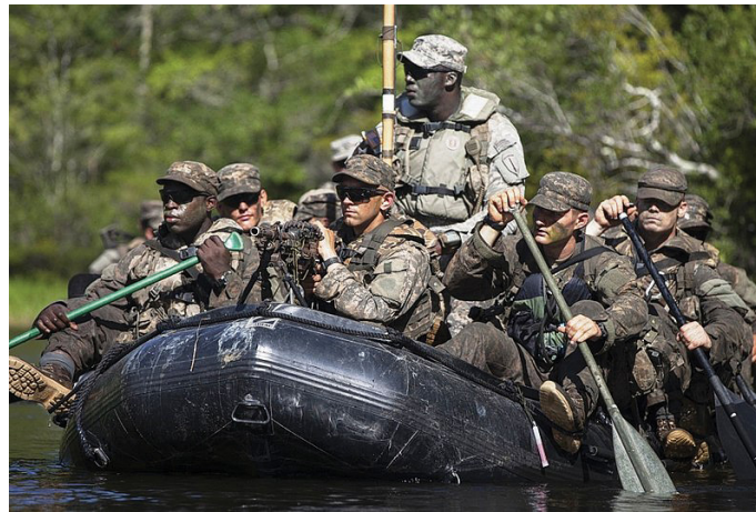
The US Army Ranger School is an intense 61-day combat leadership course oriented toward small-unit tactics. It has been called the most physically and mentally demanding leadership school the Army has to offer and it is open to Soldiers, Sailors, Airmen and Marines in the US Armed Forces, as well as allied military students. Above: Swamp Phase of the US Army's Ranger School—river insertion via Combat Rubber Raiding Craft.

Suddenly I was in a better place. I was in a different state of mind.