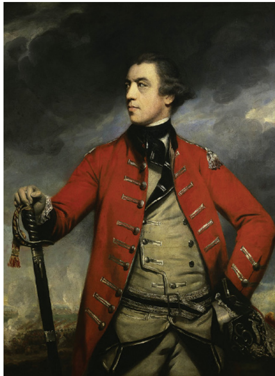
British Army GENERAL JOHN "GENTLEMAN JOHNNIE" BURGOYNE 24 February 1722–4 August 1792 (aged 70) Buried: Westminster Abbey, UK Portrait by Sir Joshua Reynolds, c. 1766

Nevertheless, as 1777 began, the strategic initiative remained with the British. Where they would exercise that initiative in the coming spring and summer campaign season was a subject of heated debate among the British generals. General Howe, the overall British Army commander in the colonies, wanted to take advantage of the British naval superiority to transport the bulk of his army from New York by sea to the shores of northern Delaware Bay and attack the colonial capital of Philadelphia directly. General John Burgoyne, one of his subordinates, proposed a different plan. He authored a plan suggesting that the British advance south from Canada via Lake Champlain in northern New York State and move northward from New York City via the Hudson River to meet in Albany, a significant trading and transportation center approximately 200 miles north of New York City. This would effectively cut off New England from the rest of the colonies and allow each of the colonies to then be defeated in detail.