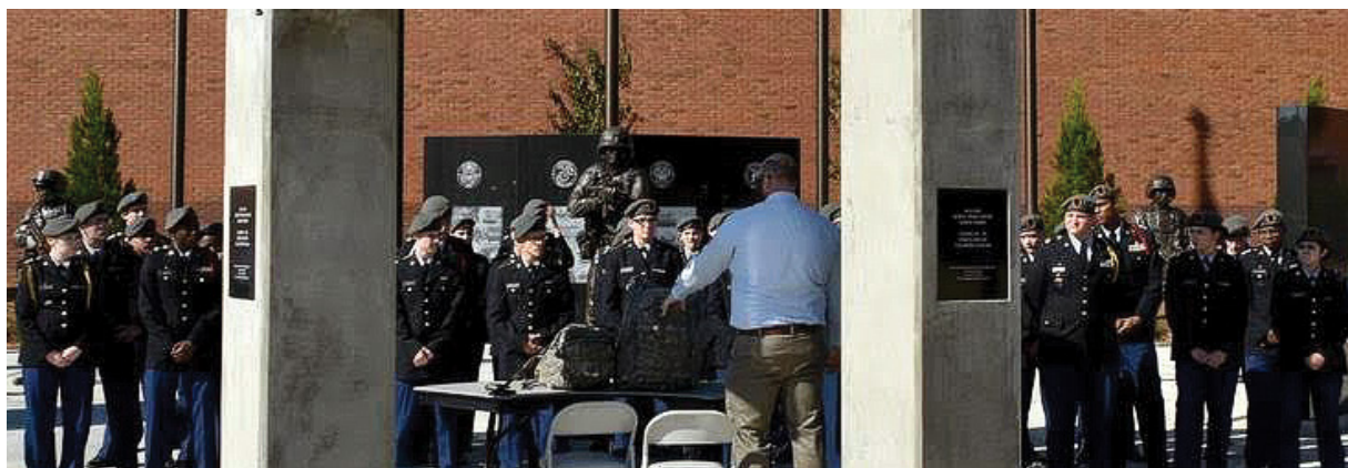
Columbus Chapter, GA