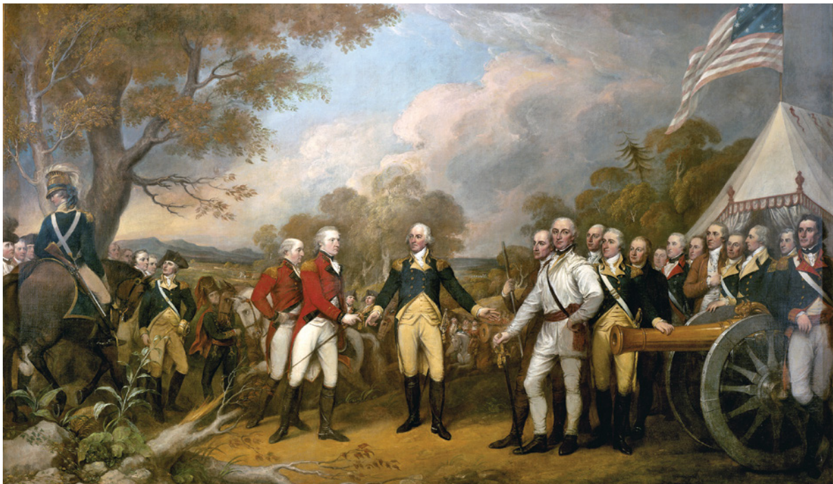
Surrender of General Burgoyne by John Trumbull. General Gates is in the center, with arms outstretched.

Thus, this relatively small battle outside of an obscure village in northern New York had in impact far greater than the relatively small forces involved. It has been called the turning point of the Revolutionary War. That characterization, however, does not describe its full impact. It was a turning point of history in that its ultimate effect was the birth of the United States of America. ★