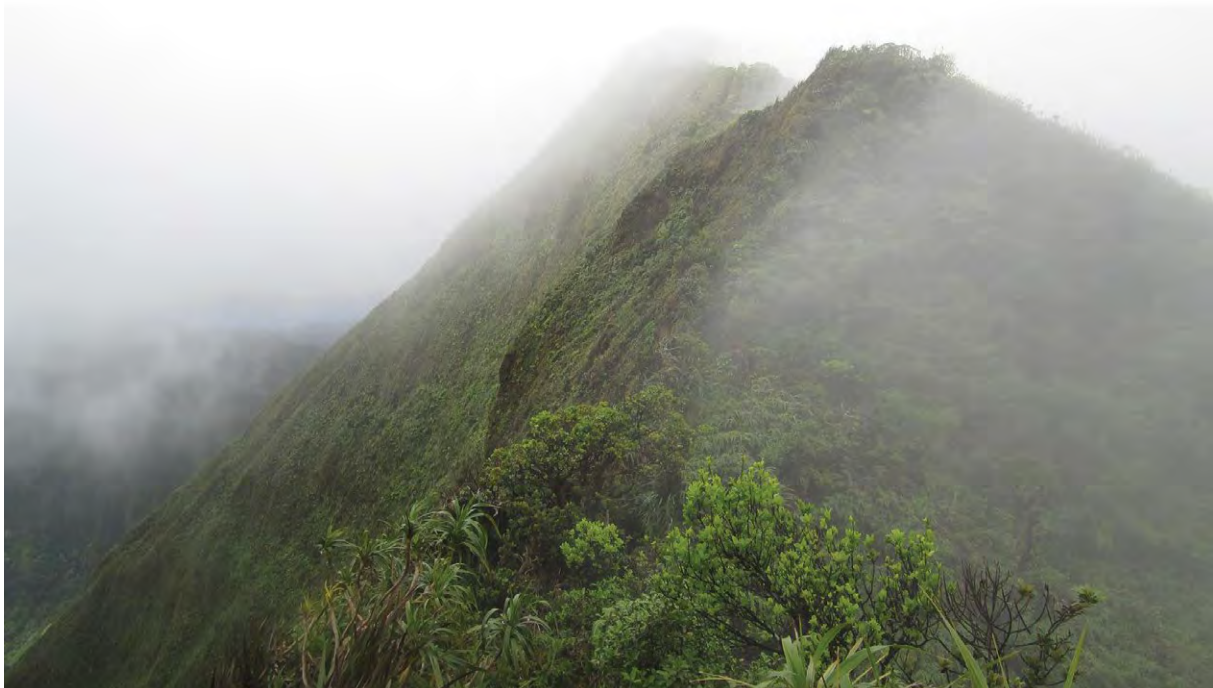
The misty and jungly summit ridge of Konahuanui.

Despite the fatigue and the muddy conditions, the vistas were stunning. On one side we gazed down upon the windward side of O’ahu. The opposite direction revealed the sprawling metropolis of Pearl City and Honolulu. It was a sight I’ll never forget. The effort that it took to reach this point in