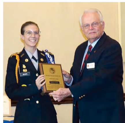
Sun City Center Chapter, FL