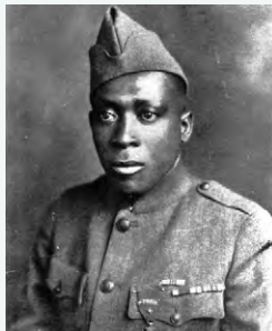
Private Henry Johnson