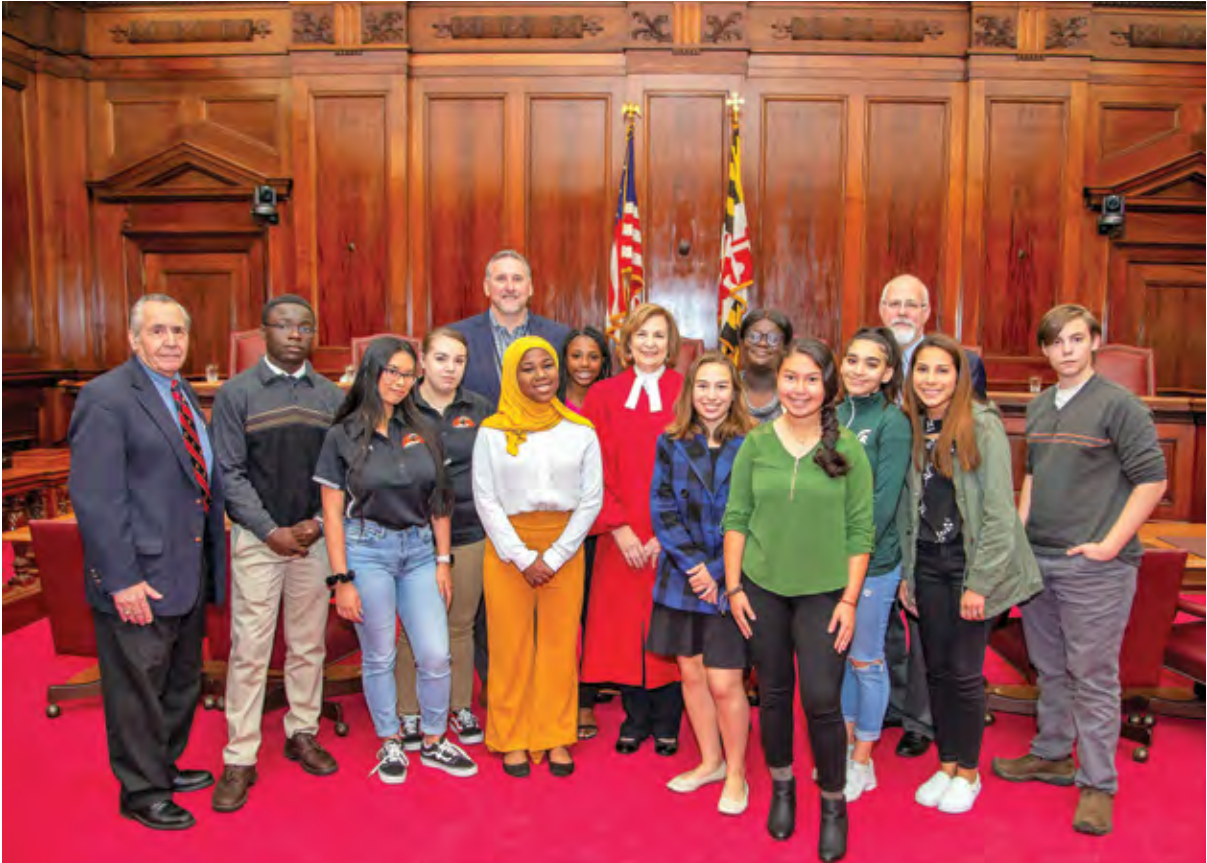
GEN Meade Chapter, MD