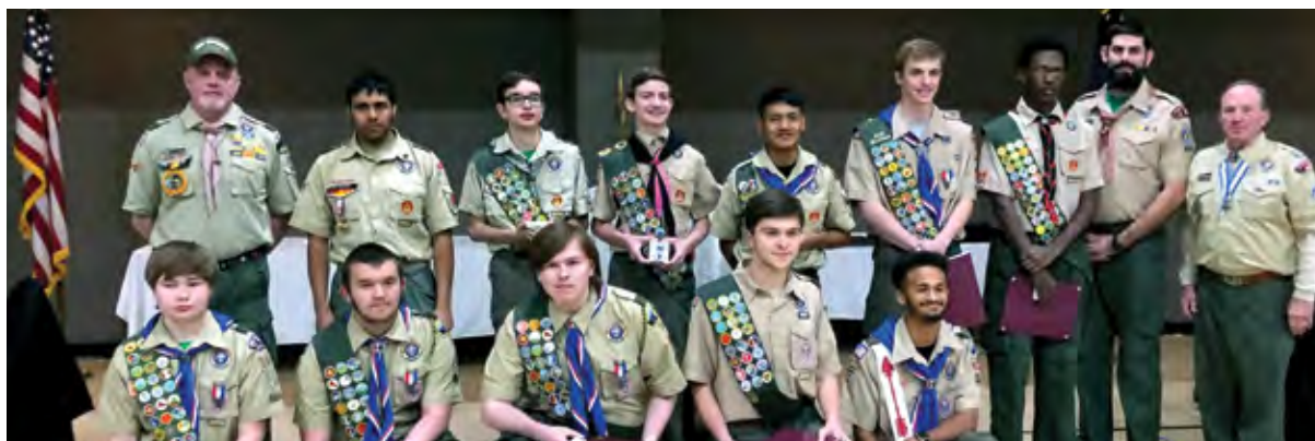
Fort Knox Chapter, KY