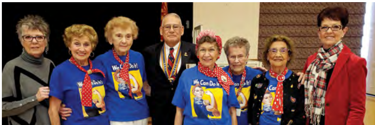
West Valley Chapter, AZ