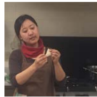
Sun Shan Intern