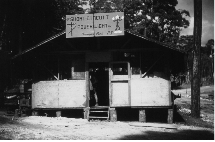
Short Circuit Power & Light Co. Camayan Point, P.I. 1953