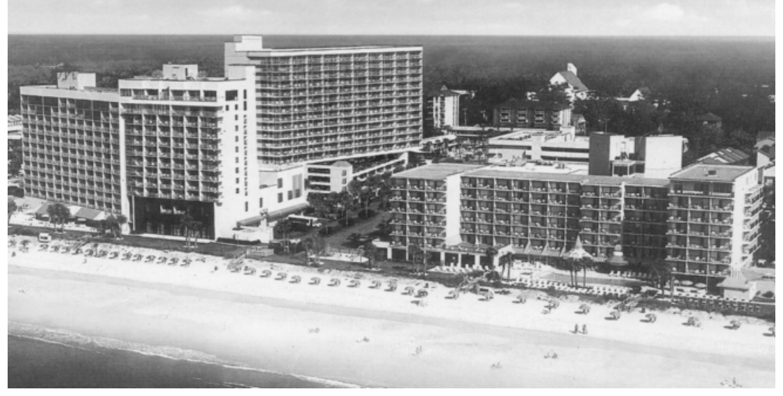
Sands Resorts, Myrtle Beach, SC, October 1 - 3, 2009!

and host to CBD 1802, CBD 1804, CBMU 1, CBMU 101 and CBMU 577