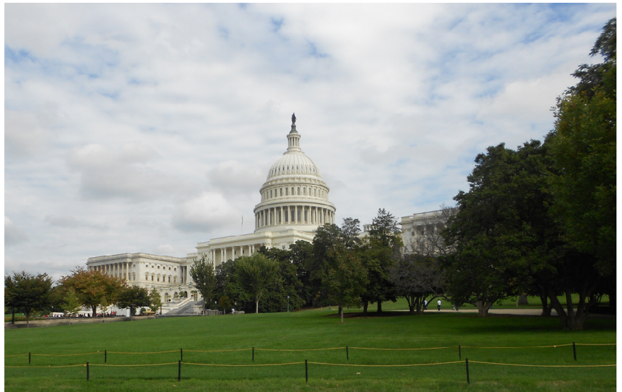
Some great monuments and buildings in Washington, D.C.