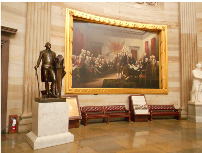
Statue of Washington & painting of Signing the Declaration by John Trumbull.