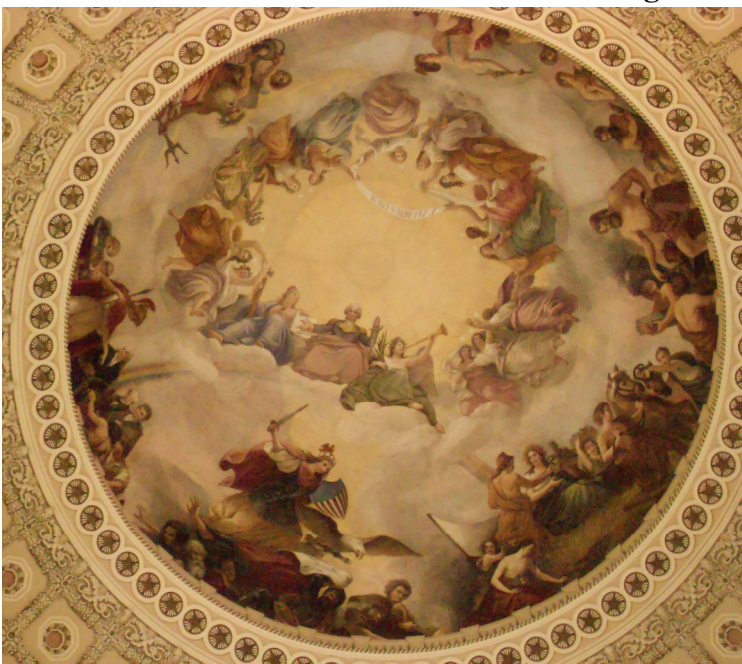
Left: Looking up at the inside of the capitol dome. The defender of the union with her sword raised, the tip of which is pointed toward George Washington. Called “The Apotheosis of Washington.”