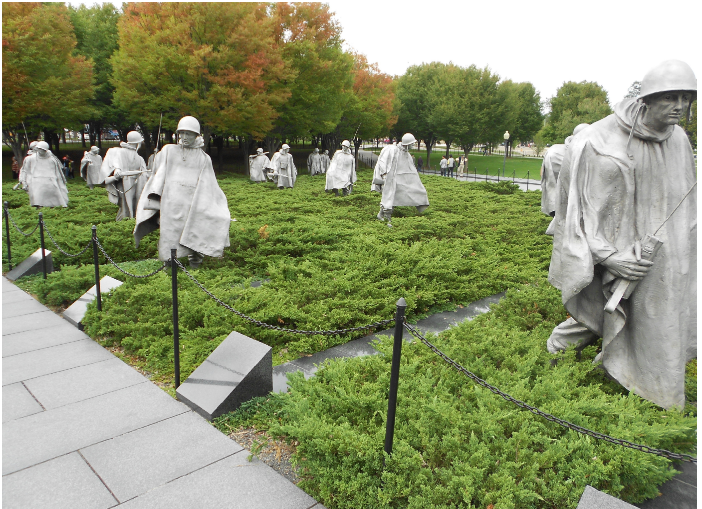
The Korean War Memorial 10

The first two days of our tours during the shutdown, Tuesday and Wednesday, were also memorable with some excellent locations. We went to the National Rifle Association Firearms Museum and saw some magnificent firearms. The engraving on the metal and carving of the wood was beyond superb. All enjoyed this tour very much. Our second day of tours began with a stop at the Seabee Memorial at the entrance to Arlington National Cemetery (see the group picture on page 9), then on to watch the changing of the guard at the Tomb of the Unknowns, which was very impressive. After we left Arlington, we went to the war memorials and went to the WW II Memorial first, which is a very large memorial and a great tribute to all WW II veterans. A short distance away is the Korean War memorial, which is the first memorial to use stainless steel on a large scale memorial. It shows a squad of men walking through junipers, which represent the rugged terrain of Korea, wearing ponchos. Across the grassy field a short distance is the Vietnam Memorial with some statues around. All in all, the tours were just a good taste of what is available to see in Washington, D.C. I hope many of our Seabees and their families will have the opportunity to come back and spend more time to see all of the sights available.