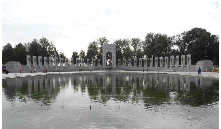
Above, left: Grave marker for Audie Murphy in Arlington National Cemetery; Above, right: Pacific side of WW II Memorial