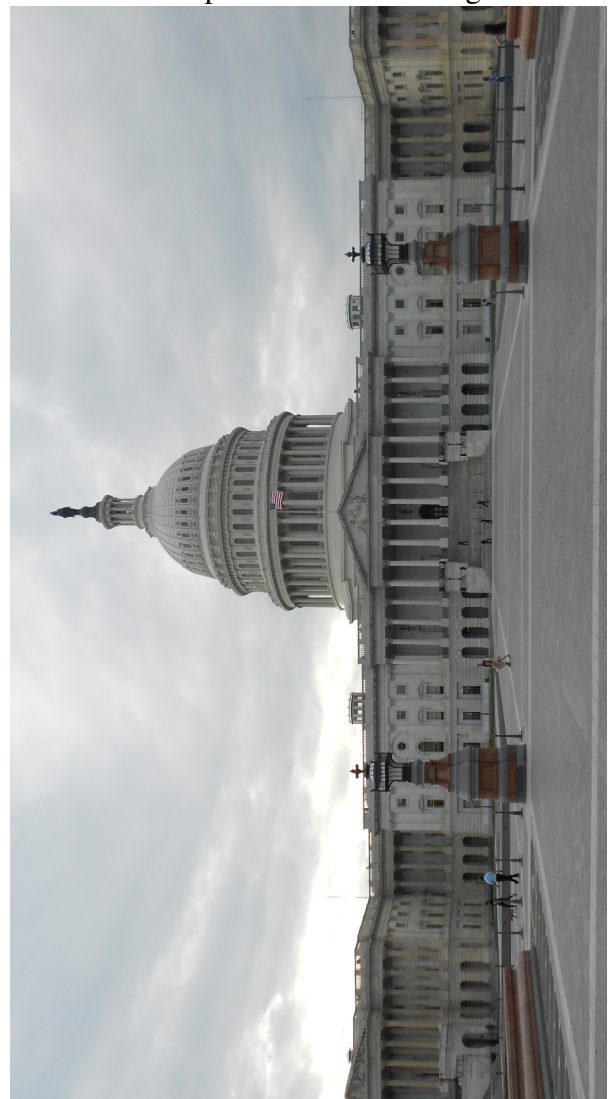
Above: Back view of the capitol; House of Representatives on the left, Senate on the right.