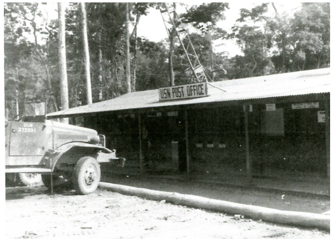
above, top left, clockwise: Cubi Point Chapel; Top Side; Post Office; Home Sweet Home. Next page, Sangley Point, 1953-1954.