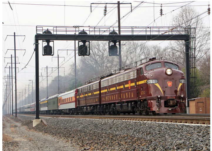
Above and below: The Liberty Limited 2010 passing through Bowie MD en route to the 2010 Army-Navy game.