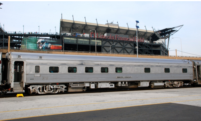
Above: The Liberty Limited 2010 is parked in Greenwich Yard adjacent to Lincoln Financial Field, site of the 111th annual Army-Navy football game.