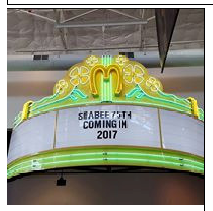
The old marquee at the movie theater on the Port Hueneme base has been restored by the Oxnard Island X-7 of NSVA. Congratulations to these Seabees! Bravo Zulu, X-7!

Automated Precision volunteered their services to 3D scan the entire monument using the latest 3D scanning equipment. This will allow the CEC/Seabee Historical Foundation to render any size monument, from table-top size up to original full scale size using the 3D data modeled in DesignX. A local university will 3D print a model of the monument for the Seabee Historical Foundation http://advancedmanufacturing.org/3d-scanning-preservesseabee-memorial/