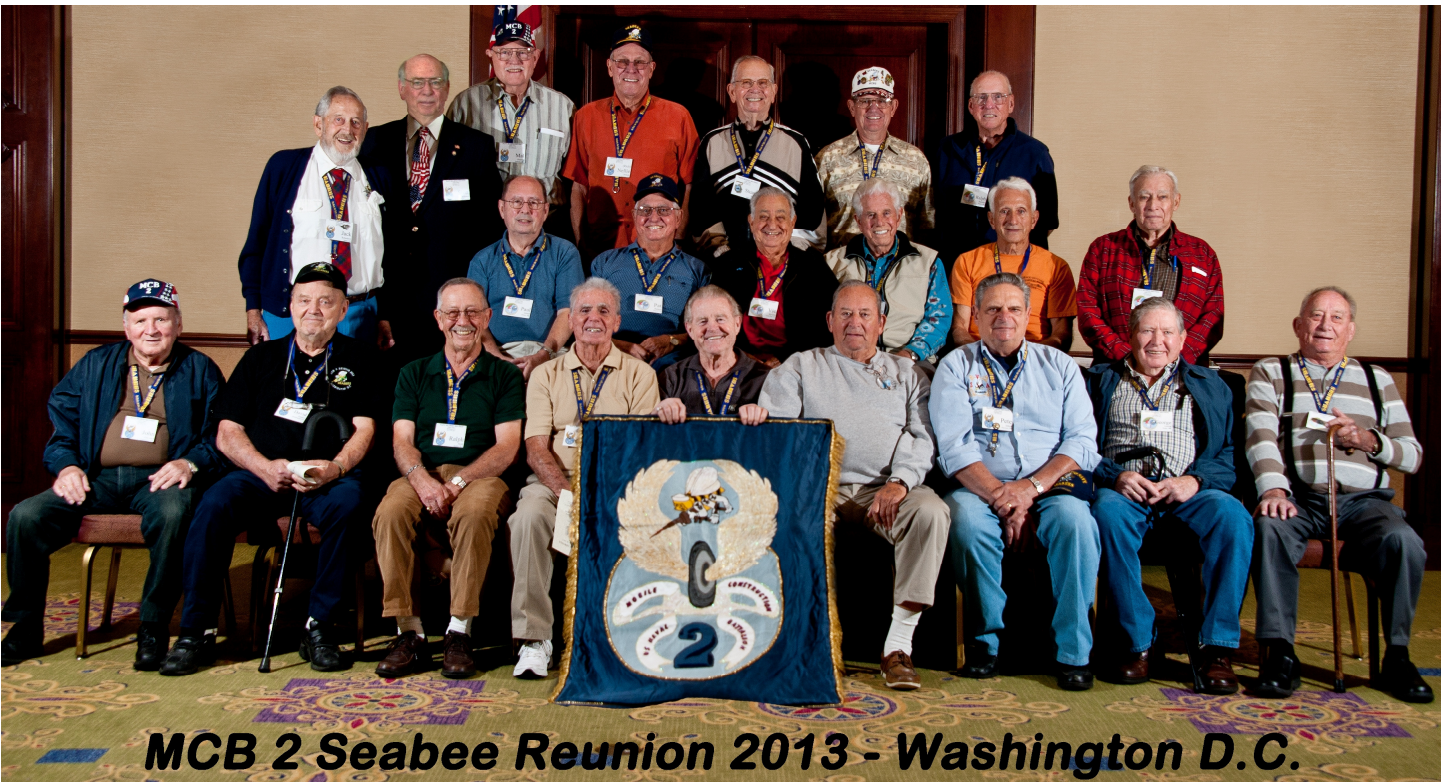
MCB 2 Seabee Reunion 2013 - Washington D.C.