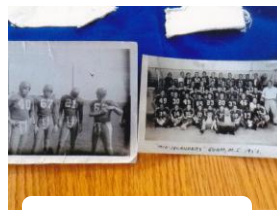
The Team Picture