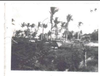
Before the football field was built. 1946-47.-on the 103 rd base