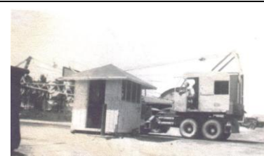
Crane returning to PW after a days work. A busy bee....47'