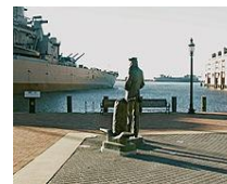
The Lone Sailor Keeping watch over the USS Wisconsin