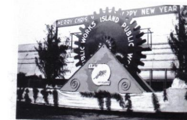
1949 CB Christmas Float