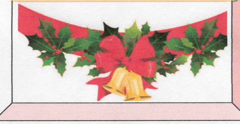
May the Holiday Seasons and New Year bring good health & happiness to you and your families.