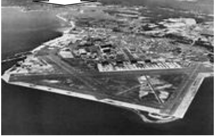
Quonset Point, Rhode Island (1939) & Davisville (1942) the home of the Seabees. NCBC Davisville closed in 1991, and the site was turned over to the State of Rhode Island. This site is considered the home of the Fighting Seabees. Location: on Quonset Point in the Narragansett Bay. A Museum is on site.

Remember Patriotism is not a sin. Freedom is never free! We thank these early patriots, as well as those patriots now fighting to keep our freedoms! You were one!