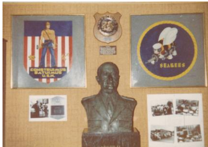
The CB Traditions are still alive and well - CAN DO