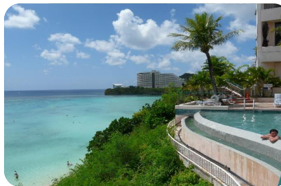
Guam Reef Hotel 2013 – Tumon Bay