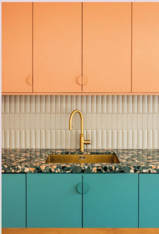
ABOVE The kitchen cabinets are made from MDF and have fronts painted in shades picked out from the terrazzo work surface

It's a standard story – but what architect Ewald Van Der Straeten came up with is far from typical. His practice gave the house a thorough upgrade with new »