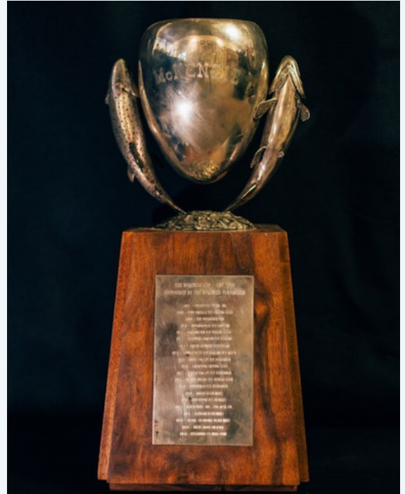
The McKenzie Cup

The Southeastern Council of FFI is pleased to be a part of the GWFF community and wishes GWFF continued success.