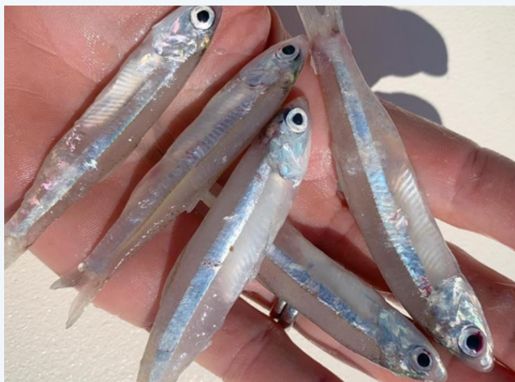
Silversides are a common forage fish to imitate.

An 8 wt. rod with floating or intermediate sinking line will work well for the Spanish, blues, and trout. A 9 wt. – 10 wt. rod is recommended for the false albacore and large redfish. If targeting sharks, use an 11 wt. If you want to bring only 1 rod, bring a 9 wt. with 2 spools. One spool would have a floating or intermediate line. The other spool would have a 350-400 grain sinking line to go deeper for the big redfish and false albacore when needed while boat fishing or to hit the deep channels of the inlet from the bank. Be ready. When you see bait busting on the surface, sometimes you don't know what's underneath it. If you are fortunate and it's a false albacore, it can rip 100 yards of line and backing off your reel in a matter of seconds. Keep your hand clear of the twirling reel handle or you will be donating some DNA. These waters and fish offer something for all anglers, newbie saltwater anglers to seasoned veterans.