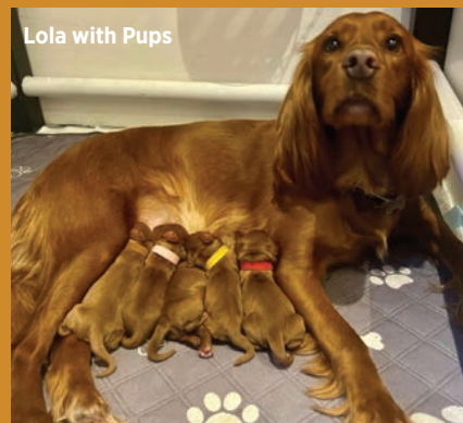
Lola with Pups