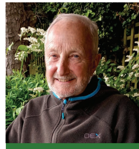
Chair, Rolleston Parish Council